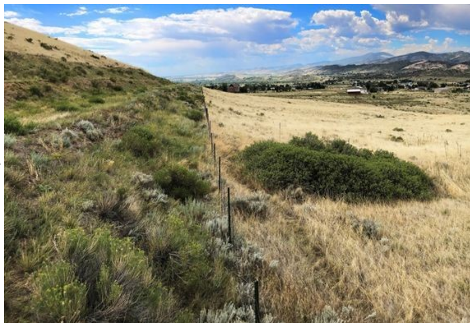
Image (right) from Planet Labs/Bayer ES of a annual invasive grassland (cheatgrass) on the right side of the fence, and an intact shrubland on the left side of the fence after cheatgrass was treated with Rejuvra.

Landowner permissions have been secured and treatment will occur on State Land Board, Western Colorado University, and City of Gunnison land around the Signal Peak trailhead areas. There may be additional funding available for private landowners with land adjacent to or nearby this area! Please reach out immediately to Aleshia Rummel at 970-707-3044 or aleshia.rummel@co.nacdnet.net if you have any interest in having cheatgrass treated at your land for free.